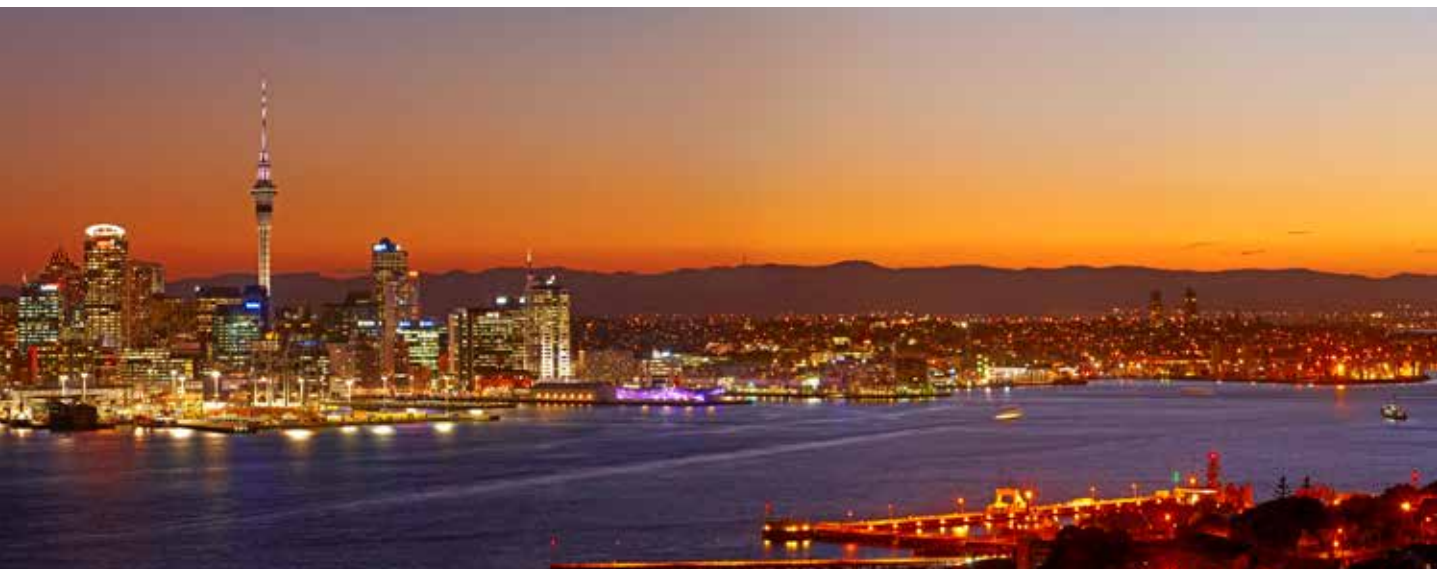
Sunset over Auckland's skyline