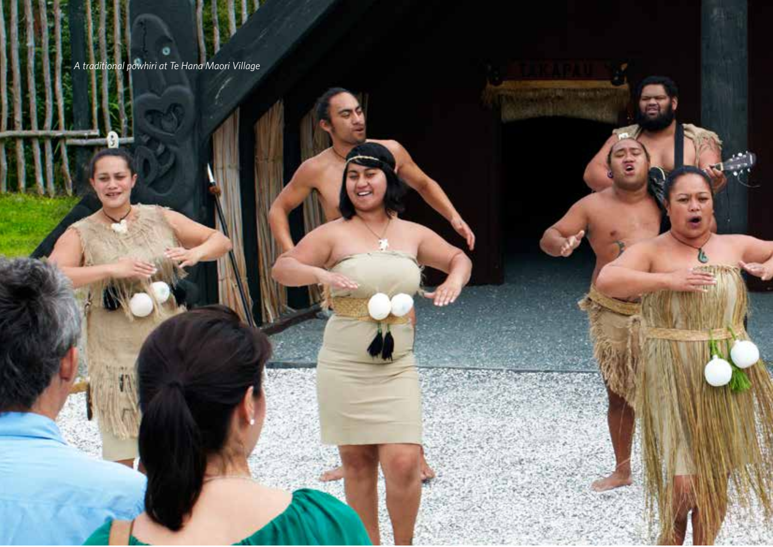
A traditional powhiri at Te Hana Maori Village