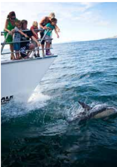
Dolphin watching on the Waitemata Harbour; Auckland Museum; Shopping in central Auckland

Staying with the transport theme, MOTAT is New Zealand's largest and leading transport and technology museum. Take an interactive journey through many of the technological achievements that have helped shape New Zealand.