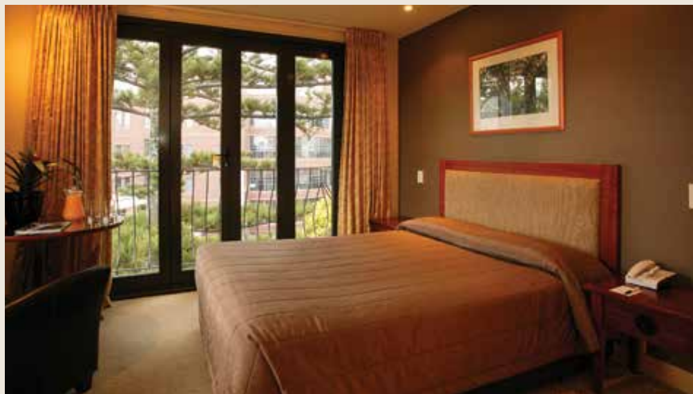
Copthorne Hotel Auckland

Copthorne Hotel Auckland City is a Qualmark 4 Star and Enviro Silver Qualmark rated hotel.