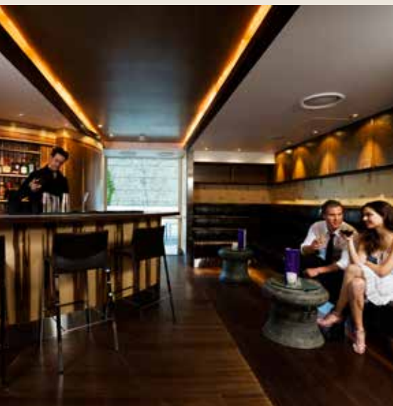
The Quadrant Hotel

Auckland Viaduct, Queen Street and High Street shopping precincts are all within walking distance.