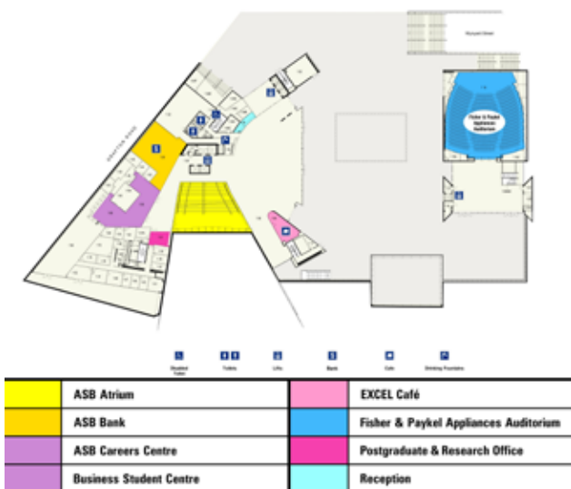
Owen G. Glenn Building, Level 1