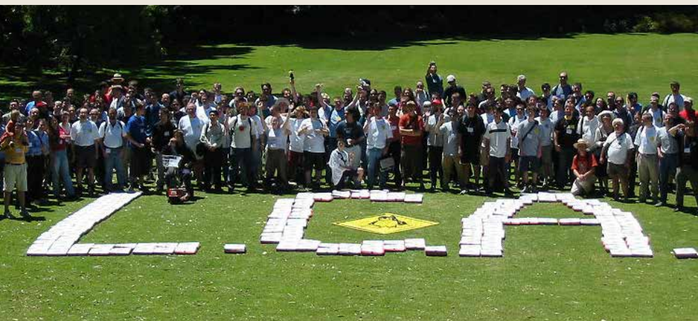
Previous LCA conferences