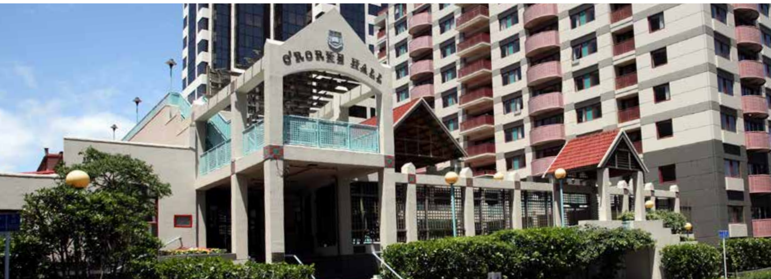
The University of Auckland, O'Rorke Hall