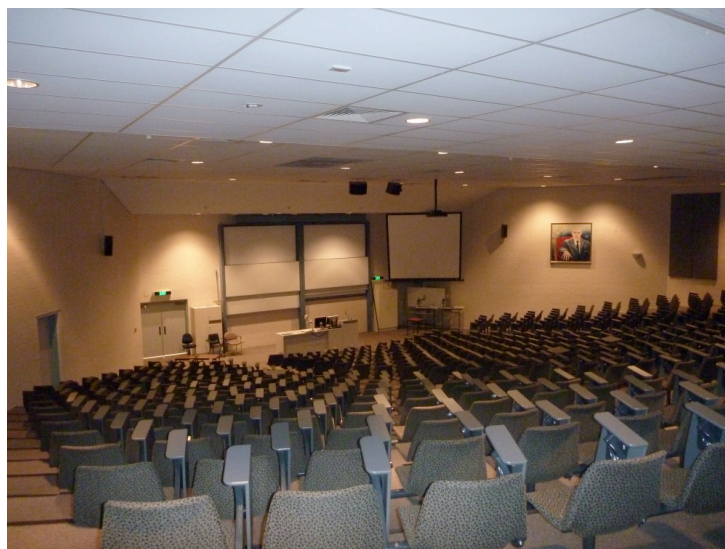
Manning Clark theatre T1

The Manning Clark lecture centre is the same venue used for all of linux.conf.au 2005. This is an integrated theatre complex, with six theatres of varying sizes, seating from 76 to 496 people.