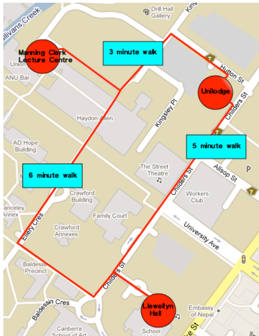
Map of relative locations of conference venues

The Canberra 2013 team proposes to use the same venue as the linux.conf.au 2005 conference, with some changes to accommodate the larger audience. Conference sessions will be hosted in the Australian National University's Manning Clark lecture centre, which is located centrally on the campus. Keynotes will be held in the Llewellyn Hall theatre at the Australian National University School of Music, which is a short walk from the Manning Clark lecture centre. It should be noted that the campus is almost entirely flat, which means it will all flood at the same time, but it is also easy to walk around.