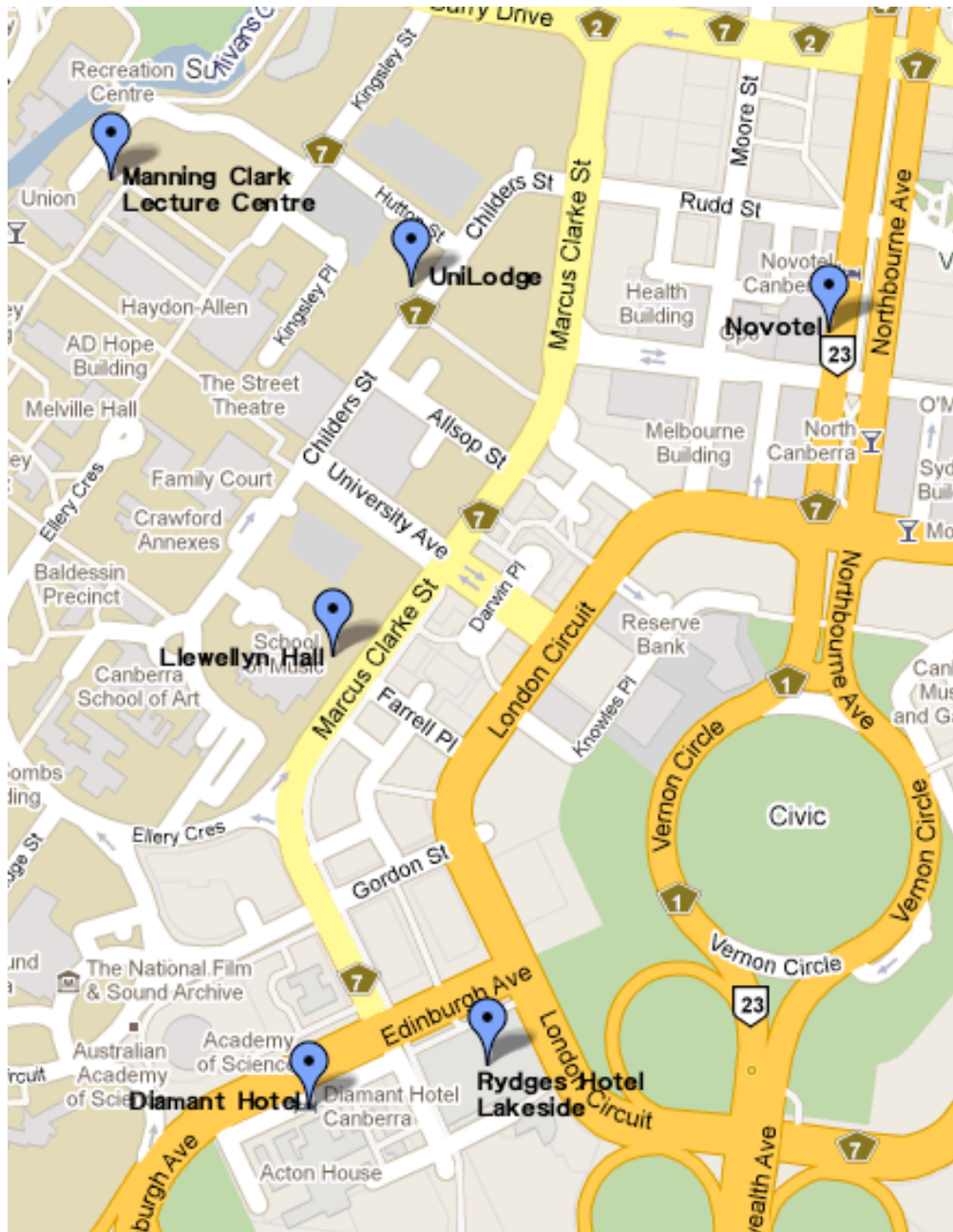
Map of conference venues and accommodation options ( Google Map )

There are a variety of accommodation options available to delegates: